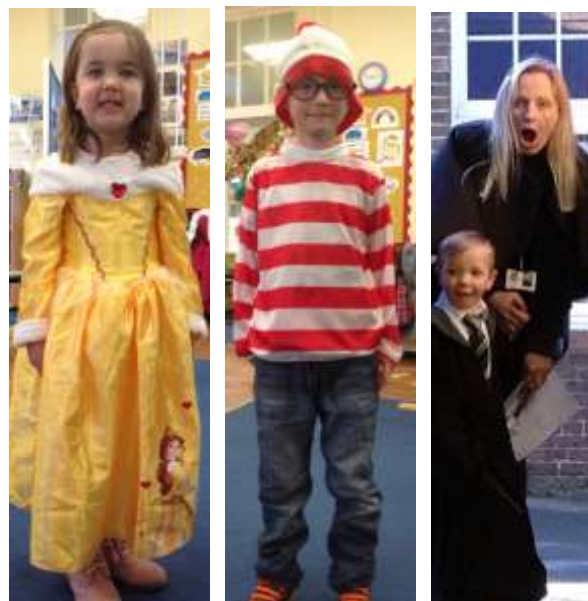
Belle, Where's Wally? and Lucius and Draco Malfoy

Muddles Green, Chiddingly, Lewes, East Sussex, BN8 6HN