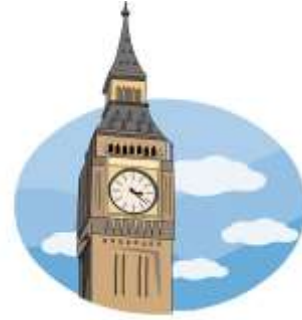
Big Ben 191