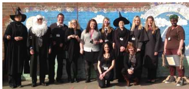
The Staff and children at 'Hogwarts'