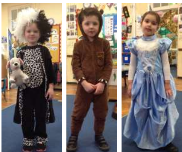
Cruella DeVil, The Gruffalo and Cinderella

We really enjoyed it and look forward to doing it all again next year!"