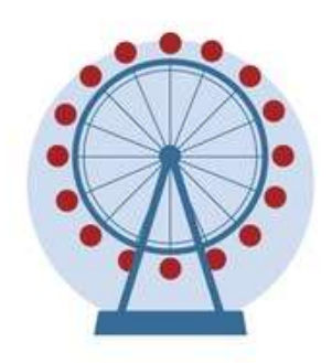
London Eye 116