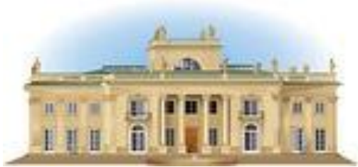
Buckingham Palace 177