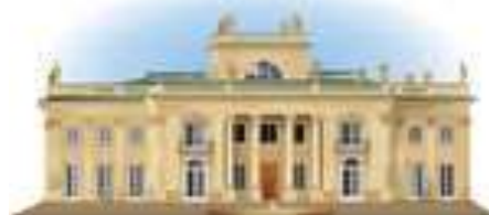
Buckingham Palace 225