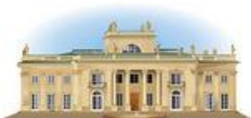
Buckingham Palace 147