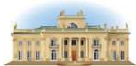
Buckingham Palace 95