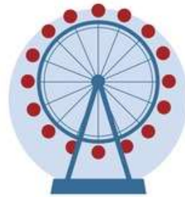
London Eye 87