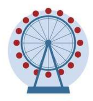
London Eye 243