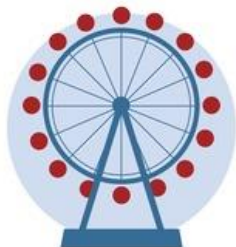
London Eye 245