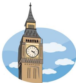
Big Ben 288