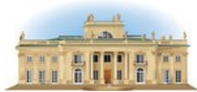
Buckingham Palace 19