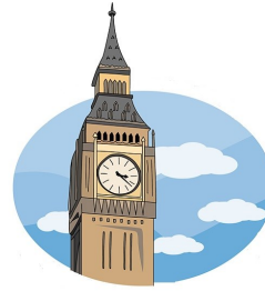
Big Ben 14