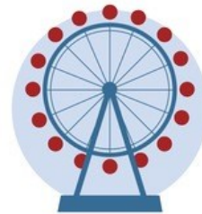
London Eye 5