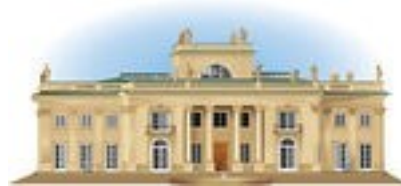
Buckingham Palace 137