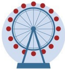
London Eye 109