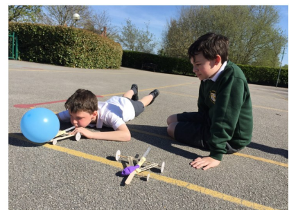
Balloon Powered Cars

More information to follow next week in the school clubs letter for Term 4!