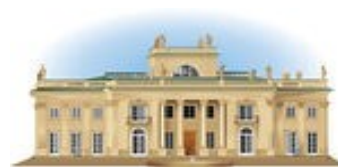
Buckingham Palace 135