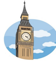
Big Ben 71