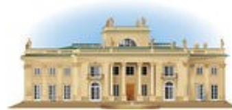
Buckingham Palace 112