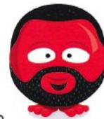
Sir Lenny Henry