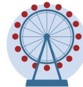
London Eye 115