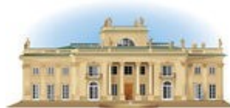
Buckingham Palace 79