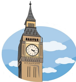
Big Ben 20