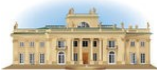
Buckingham Palace 130