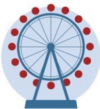
London Eye 124