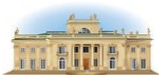
Buckingham Palace 109