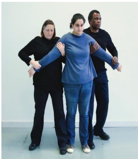
2 person Straight Arm