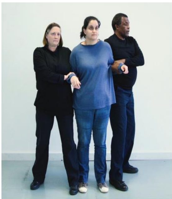
2 person Bent Arm