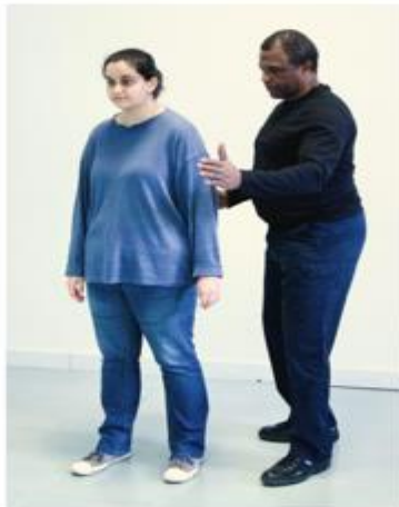
Guiding with lead hand