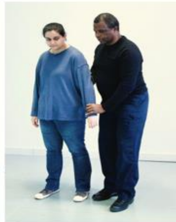
Escorting with both hands