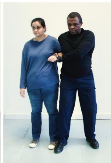
Pull back, keep them close