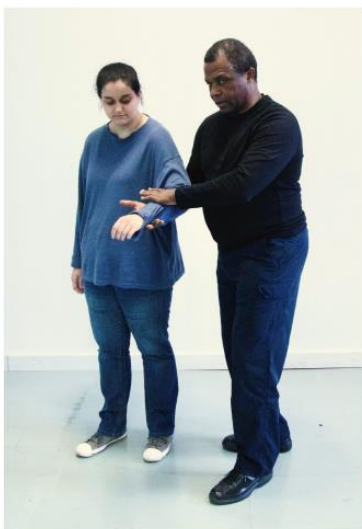
Correct hand positions