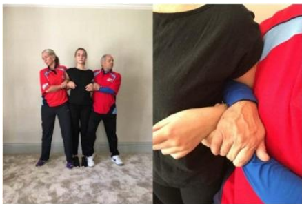
Figure of Four

If the child is attempting to run/walk while in this technique, or you need them to walk, use the position of your hip to do this – put your hip in front of theirs to stop them, put your hip behind theirs to make them move forward.