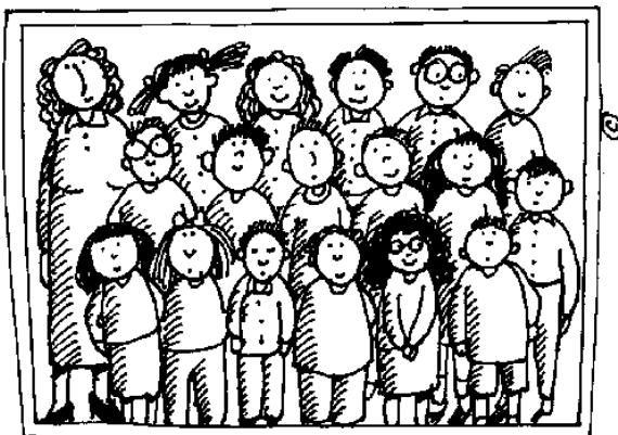
CLASS PICTURE DAY IS COMING SOON.!