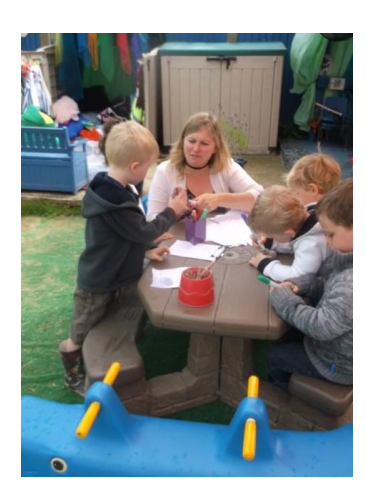
Thank you, Nursery Team

Could we please ask that you leave toys at home so that they do not get lost. Rising 5s please could we remind you to bring your book and phonics book back so they can be changed each week.