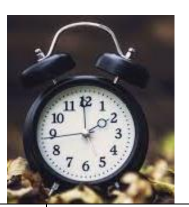
Fractions and decimals