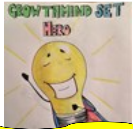
Year 3 and 4

I am a Detective Find-It in Maths because when I got a question wrong I looked back and used a 100 square to help me.