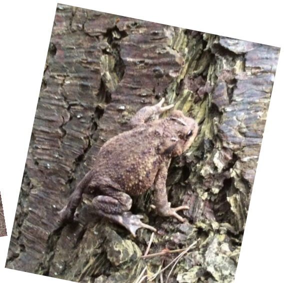
Scarlett found this toad camouflaged on a tree trunk!