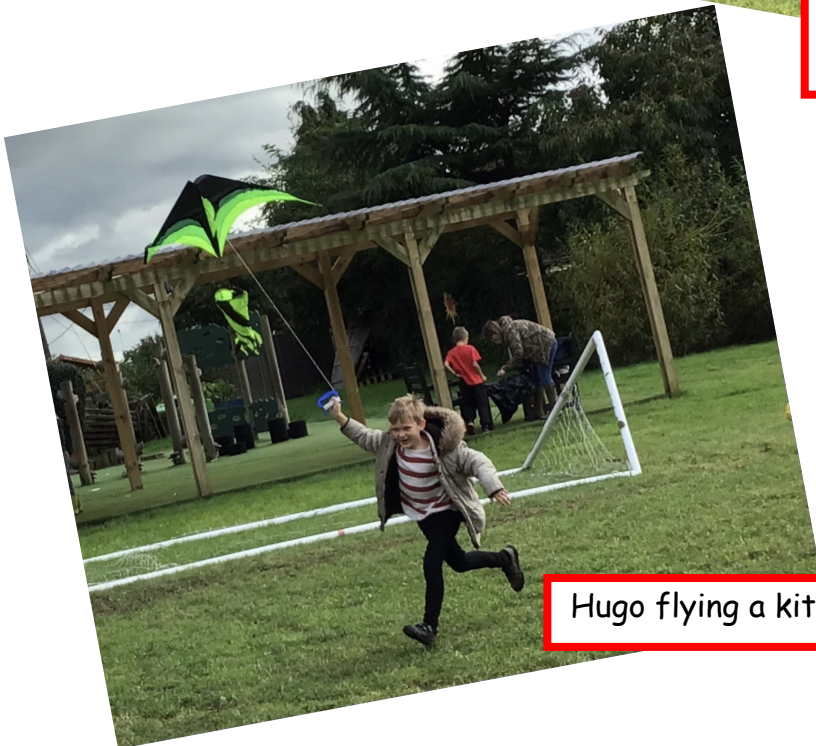
Hugo flying a kite