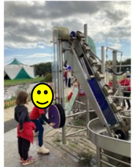
In the Water Park we explored the power of water.

"We learnt that magnets with holes in, keep things moving, If they don't have holes in them they stop!"