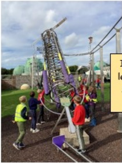
In the discovery Park we learnt how an Archimedes Screw can move objects by twisting.