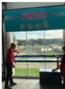
We put the learning from our science focus into practice in the forces section of the centre.