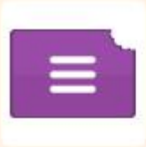
Open, close or share a file