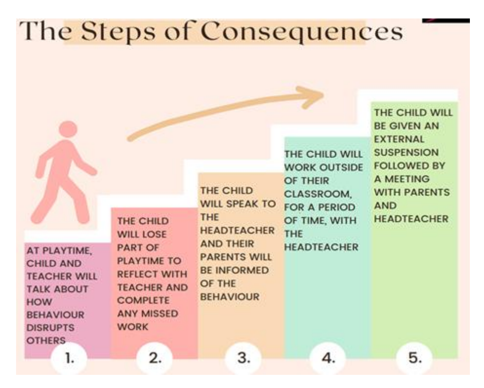
Step 1 – Discussion at playtime to discuss behaviours

<u>Step 2</u> – A step 2 means children in KS1 will lose 15 minutes. KS2 children will lose 30 minutes of lunch time. If behaviours persist: