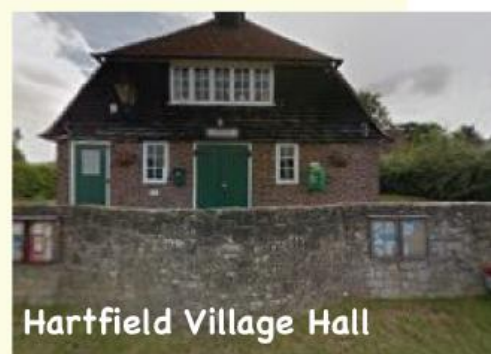
Hartfield Village Hall

The Supervision of your child is your responsibility