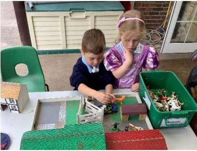
Playing with our new friends

We have been getting to know one another and finding out about our classroom and our new school environment. We have also been spending time with our buddies.