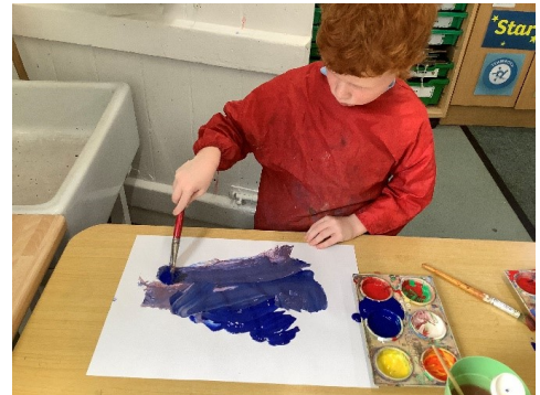
Painting with different implements