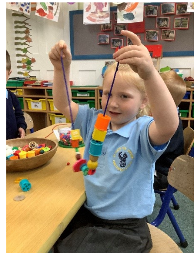
Doing lots of fine motor activities