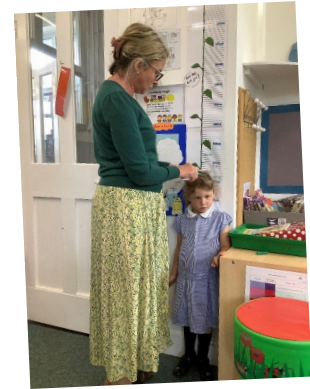
Putting all of our heights on the height chart