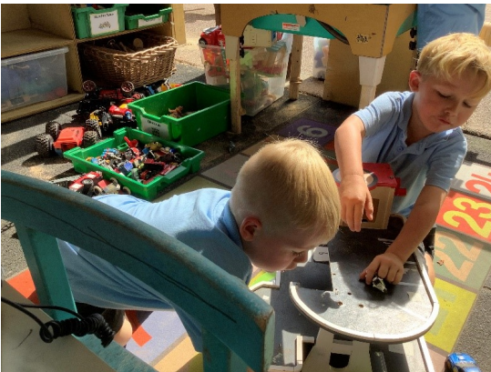
Sharing and turn-taking