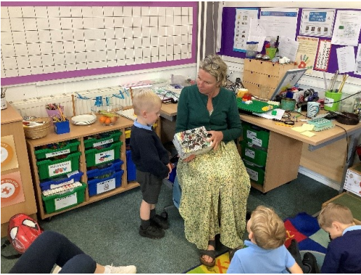
Sharing our treasure boxes!