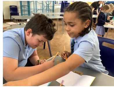
Preparing our 3D expression through art