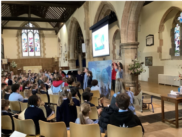
Thinking about our Values