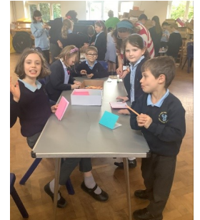
Preparing our drama