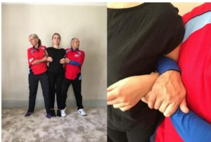
Figure of Four

If the child is attempting to run/walk while in this technique, or you need them to walk, use the position of your hip to do this – put your hip in front of theirs to stop them, put your hip behind theirs to make them move forward.