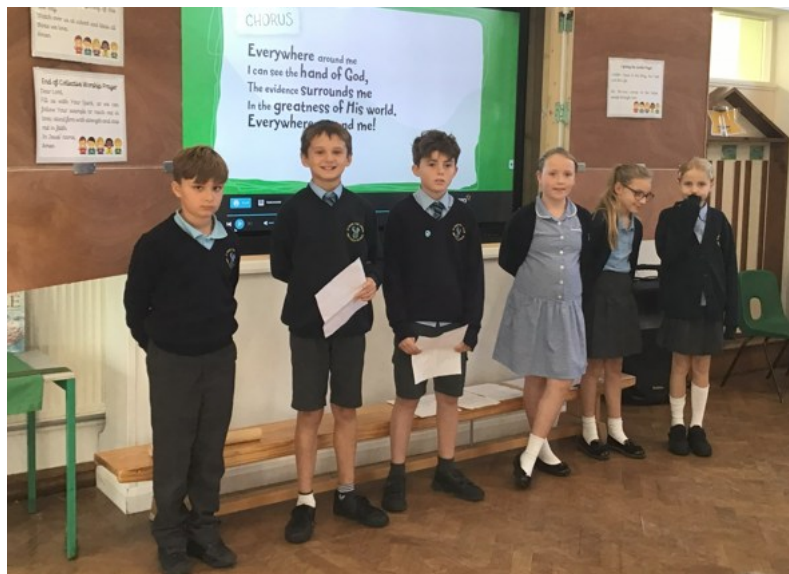
Our new Pupils as Leaders this year are:

At the start of a new year, there are many new beginnings including new roles. The children have been thinking about roles of responsibility across the school that they would like to apply for. These include Library monitors, Peer Guardians, Head Gardeners, Playground Monitors, and Pupil Governors. Giving children responsibility helps to develop and nurture accountability and an awareness of the role that they play to make a difference and the impact they can create. Children were told the job description and for some of these positions they had to apply for, including sharing why they think they are suitable for the role. The rest of the school then voted for the person that they thought would have the greatest impact. We talked about democracy having the opportunity to vote, that enables us to have our own voice and make decisions together.